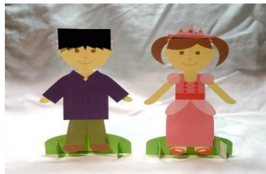
Paper Doll example