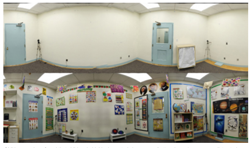
CMU researchers found that children in highly decorated classrooms (bottom image) were more distracted, spent more time off-task and demonstrated smaller learning gains than when the decorations were removed (top image).

"Therefore, I would suggest that instead of removing all