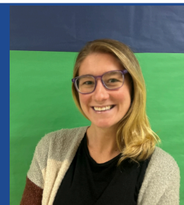
Presented by Madison Young

Explore using Canva to create FREE resources you will use over and over again! There is so much you can create to benefit your classroom and students daily!