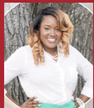
Presented by Antoinette Smith

PowerPoints are valuable tools that enhance the learning experience by creating interactive opportunities for students to engage with material in various ways. Student engagement is crucial for classroom success, as it ensures that they have not only absorbed but also retained the information presented.