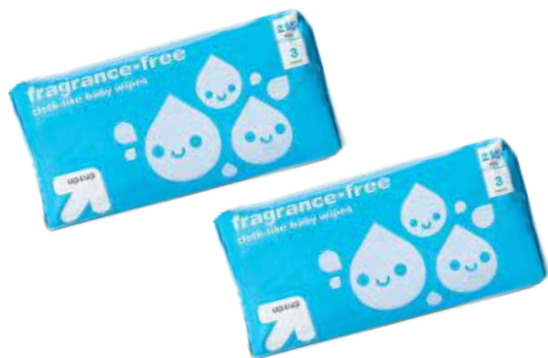
2 Packs of Baby Wipes