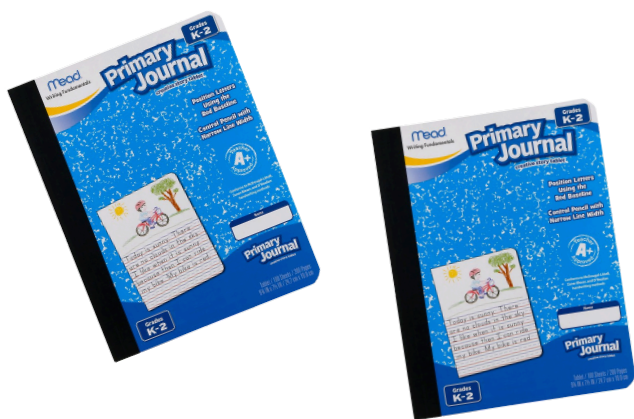
2 Primary Journals