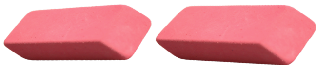
2 Large Pink Erasers