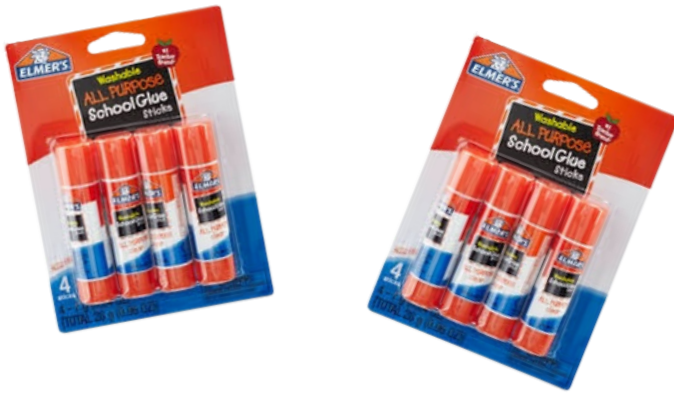
2 packs of Glue Sticks