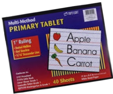
1 Primary Writing Tablet