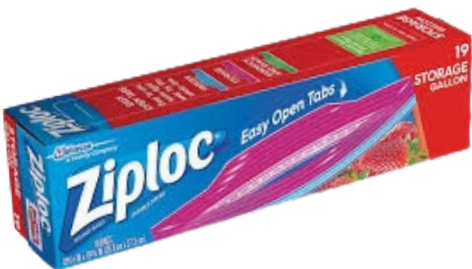
1 Gallon Sized Ziplock Bags