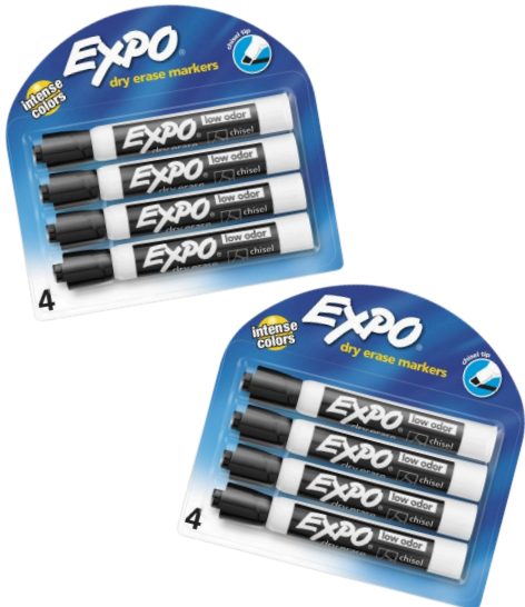
2 Packs of Black Expo Markers