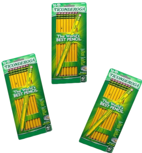
3 packs of Pencils