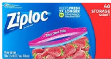
1 Quart Sized Ziplock Bag