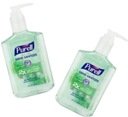
2 Bottles of Hand Sanitizers