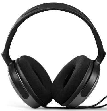
1 Pair of Headphones