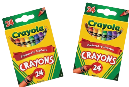
2 Boxes of Crayola crayons